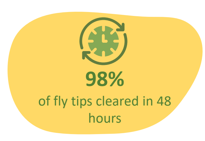
Fly tipping data relates to tips on public land only

This is similar compared to last quarter of 13.23%. The 12-month rolling average is: 15.8%